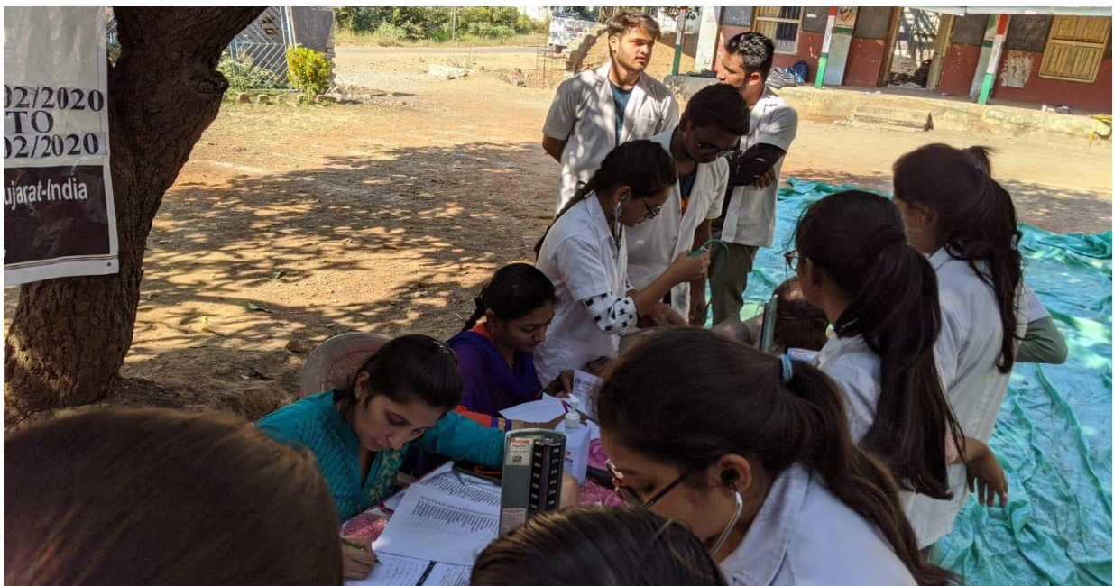
CAMP AT ANDARGOTA VILLAGE