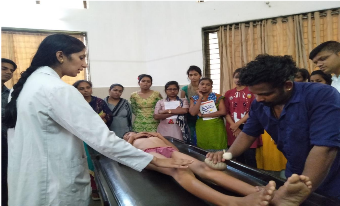
PRACTICAL DEMONSTRATION TO TRAINEES OF AYUSHMAN BHARAT