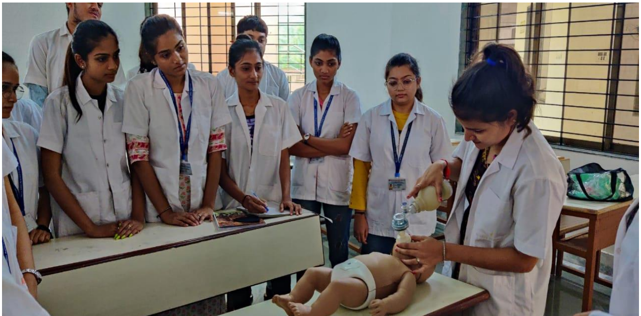
PRACTICAL DEMONSTRATION ON RESUSCITATION