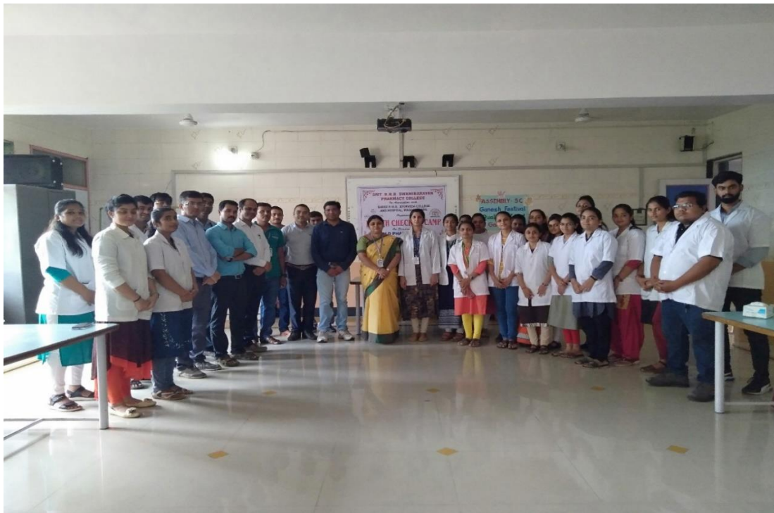
CAMP ORGANISED AT SWAMY NARAYAN SCHOOL