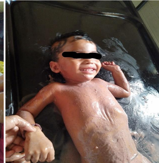
SHASHTIKA SHALI PINDA SWEDA IN CHILDREN