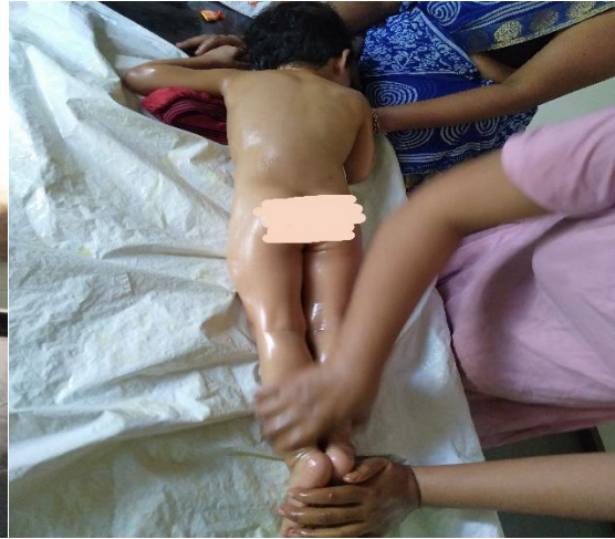
SARVANGA ABHYANGA IN CHILDREN