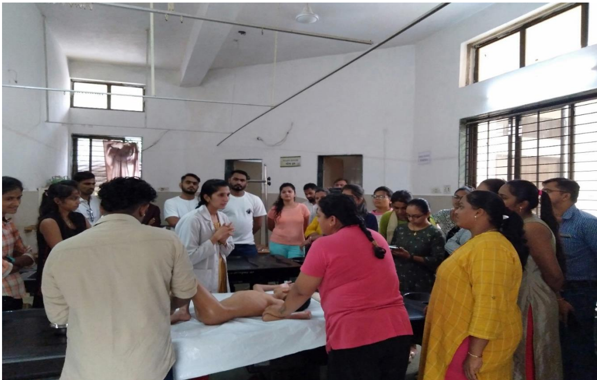
PRACTICAL DEMONSTRATION TO TRAINEES OF AYUSHMAN BHARAT