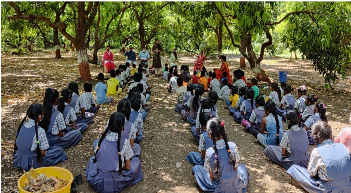
CAMP AT ANDARGOTA VILLAGE