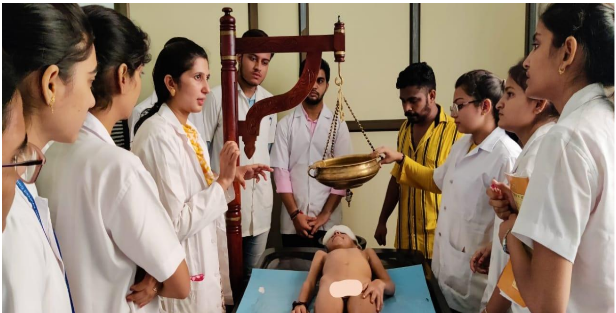
PRACTICAL DEMONSTRATION ON PANCHAKARMA IN CHILDREN