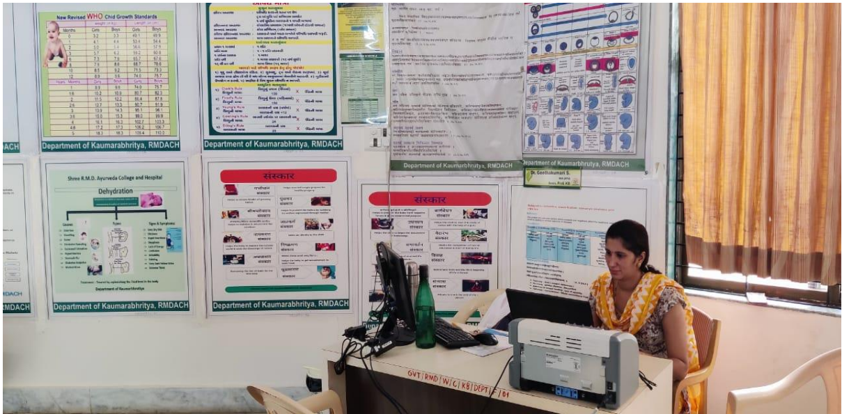
DEPARTMENT OF KAUMARABHRITYA