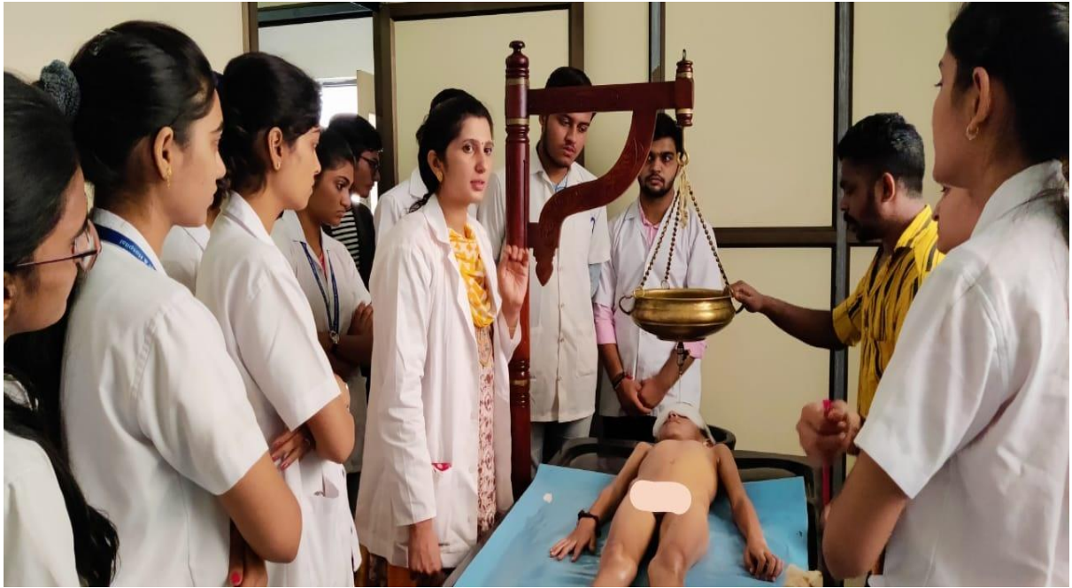
PRACTICAL DEMONSTRATION ON PANCHAKARMA IN CHILDREN