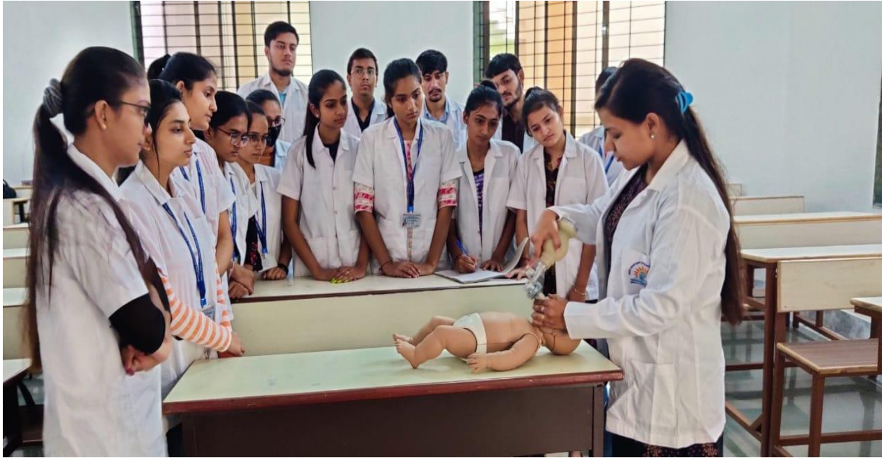
PRACTICAL DEMONSTRATION ON RESUSCITATION