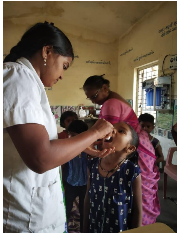
SWARNA PRASHANA CAMP