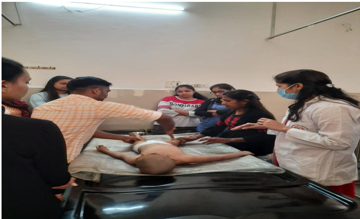
PRACTICAL DEMONSTRATION TO TRAINEES OF AYUSHMAN BHARAT