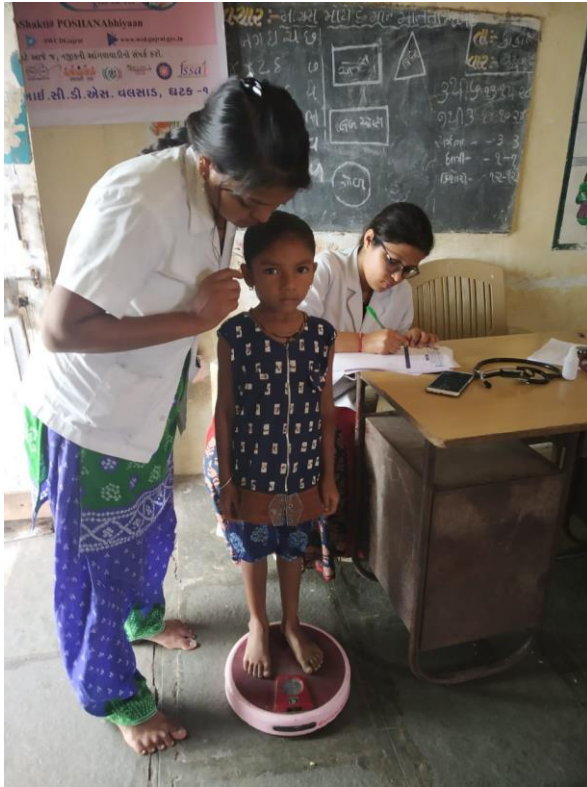
GROWTH & DEVELOPMENT ASSESSMENT FOR ANGAVADI CHILDREN