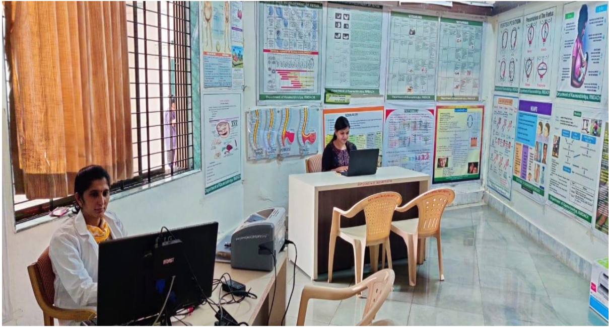
DEPARTMENT OF KAUMARABHRITYA