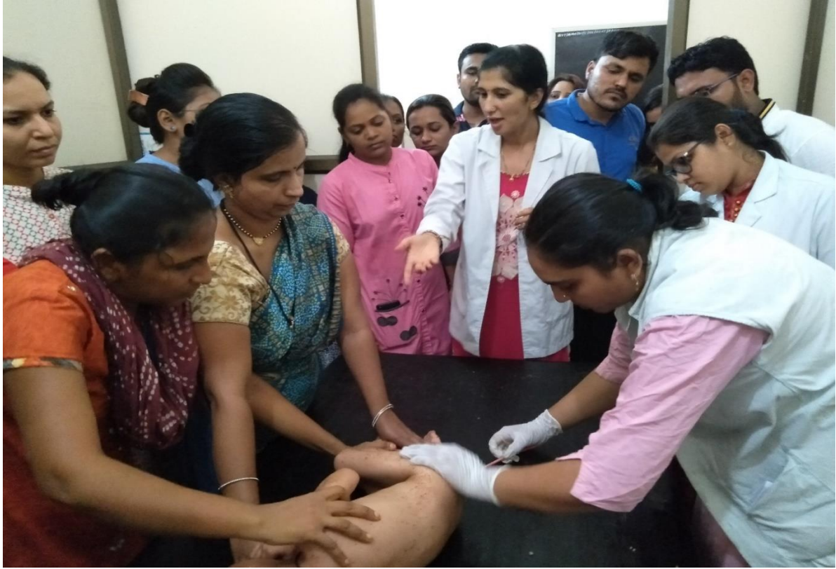
PRACTICAL DEMONSTRATION TO TRAINEES OF AYUSHMAN BHARAT