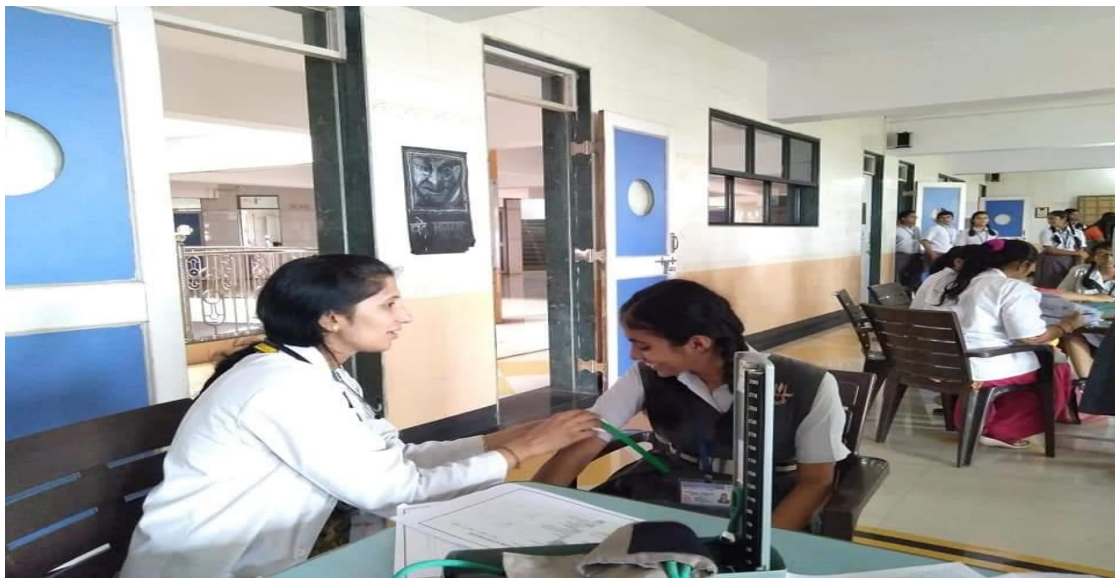
CAMP ORGANISED AT SWAMY NARAYAN SCHOOL