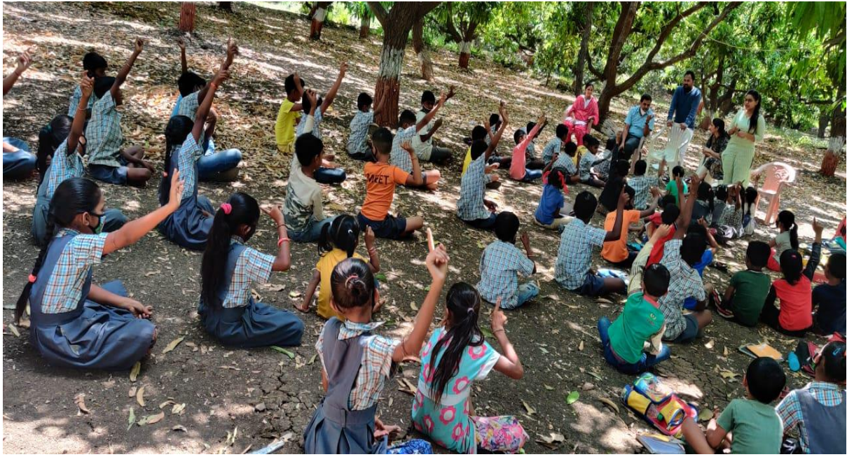
CAMP AT ANDARGOTA VILLAGE