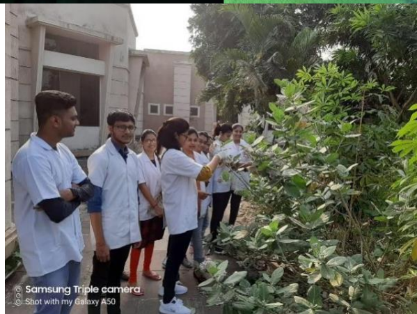
Arka Ksheera Collection