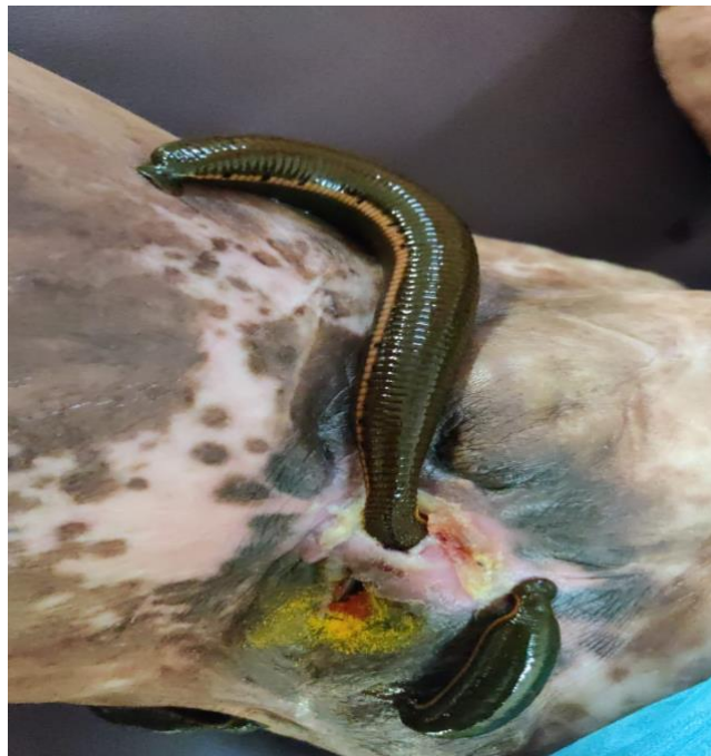
Anushastra Karma: Jalauka Avacharan