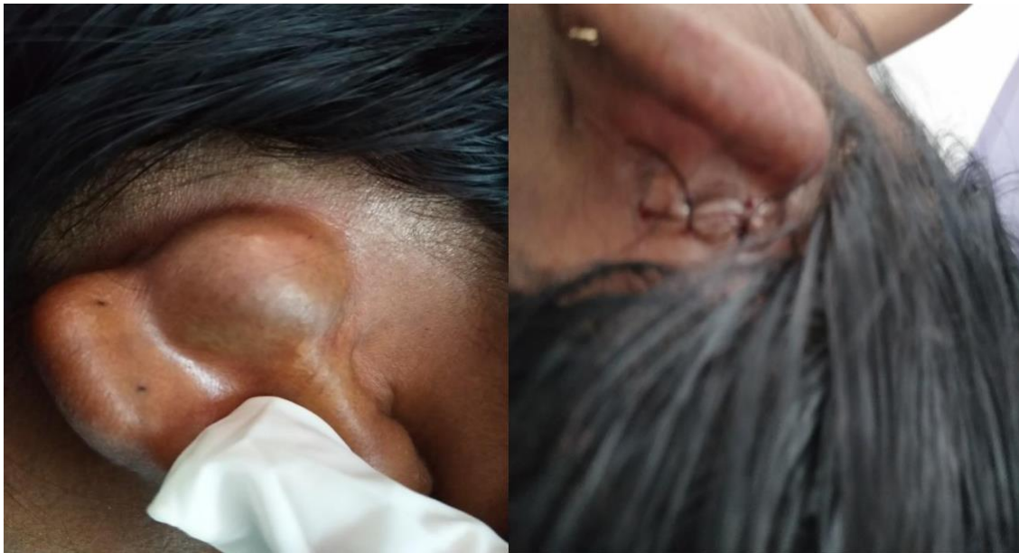
Dermoid Cyst Excision