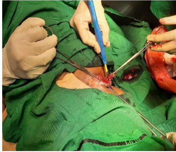
Surgical Procedures in OT