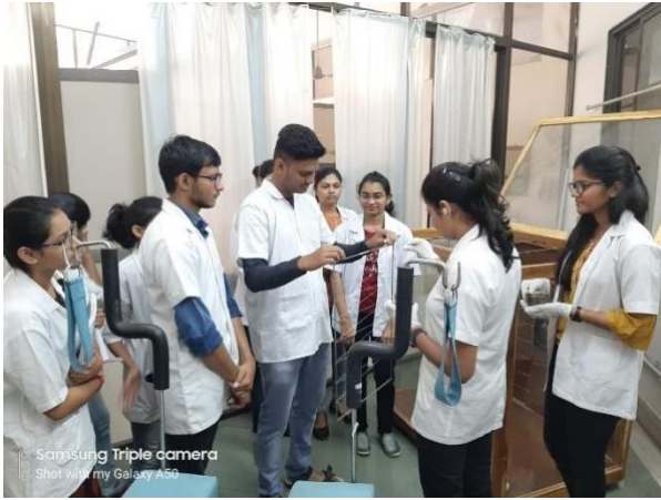
Hands-on: Ksharsutra preparation