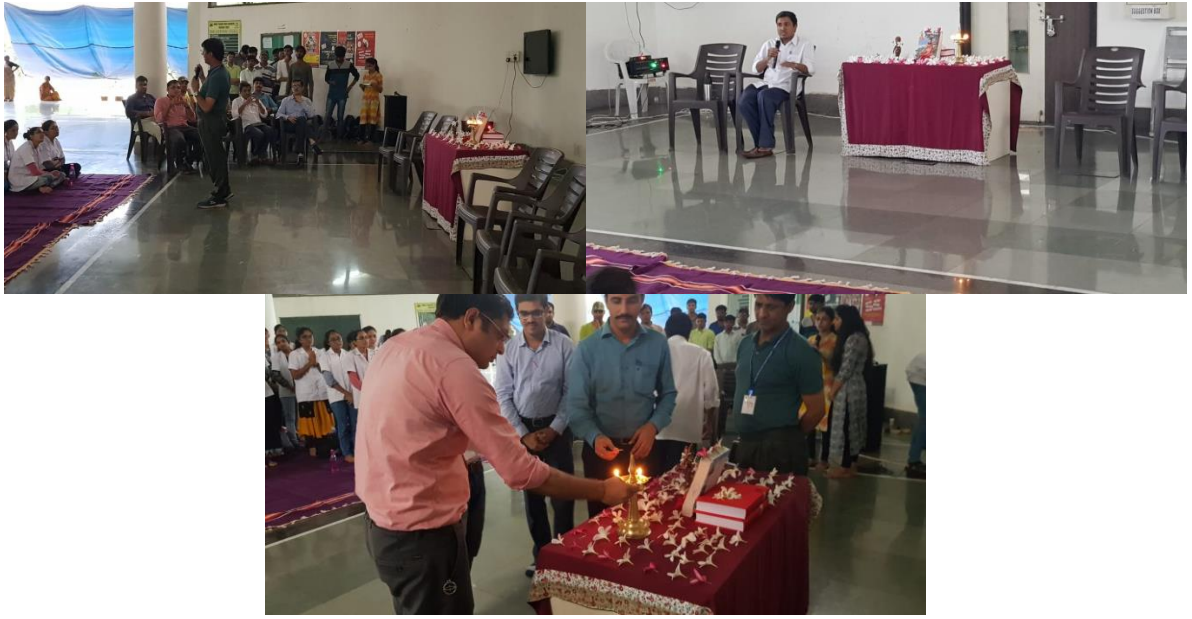
Charak Jayanti Celebration 2019.